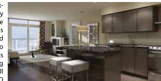
All suites offer quality features and finishes

Pemberton Group has more than 50 years' experience building superb communities in many of the Greater Toronto Area's most desirable neighbourhoods. This fall Pemberton unveils Vivid —one of Etobicoke's most convenient and commuter-friendly locations. A new addition to this established community at Bloor and Dundas Streets, Vivid will offer a brilliant lifestyle, exciting suites and on-site amenities, all just a short stroll from the Islington subway station, Kipling GO station, shopping, restaurants and numerous services.