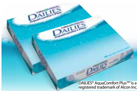
DAILIES® AquaComfort Plus™ is a registered trademark of Alcon Inc.

Yonge Vision | 1881 Yonge Street | 416.932.9086 • YongeVision.com