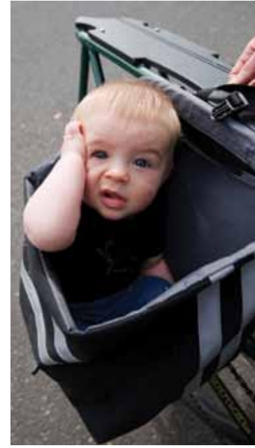
Sport Swap | 1541 Bayview Ave. 416.481.7927 • SportSwap.com

Visit Sport Swap for expert advice on all your cycling needs this season.