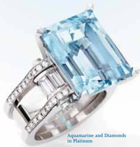
Aquamarine and Diamonds in Platinum

1901 Avenue Rd. • 416-787-4545 • fortunes.com